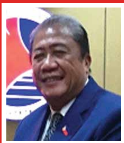
Arthur P. Tugade Distinguished Professorial Chair in Legal Management