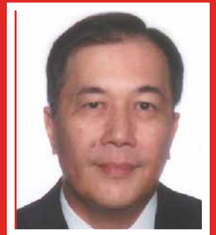
Arthur R. Macapagal Distinguished Professorial Chair in Business and Economics