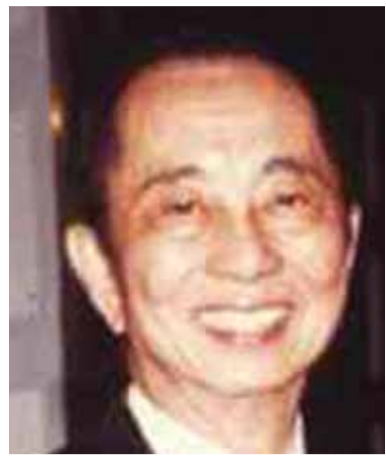
Eugenio M. Lopez, Jr. Distinguished Professorial Research Chair