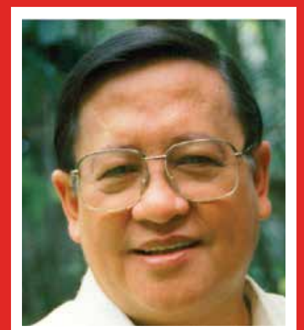
Raul S. Roco Distinguished Professorial Chair in Philosophy, Literature, and Humanities