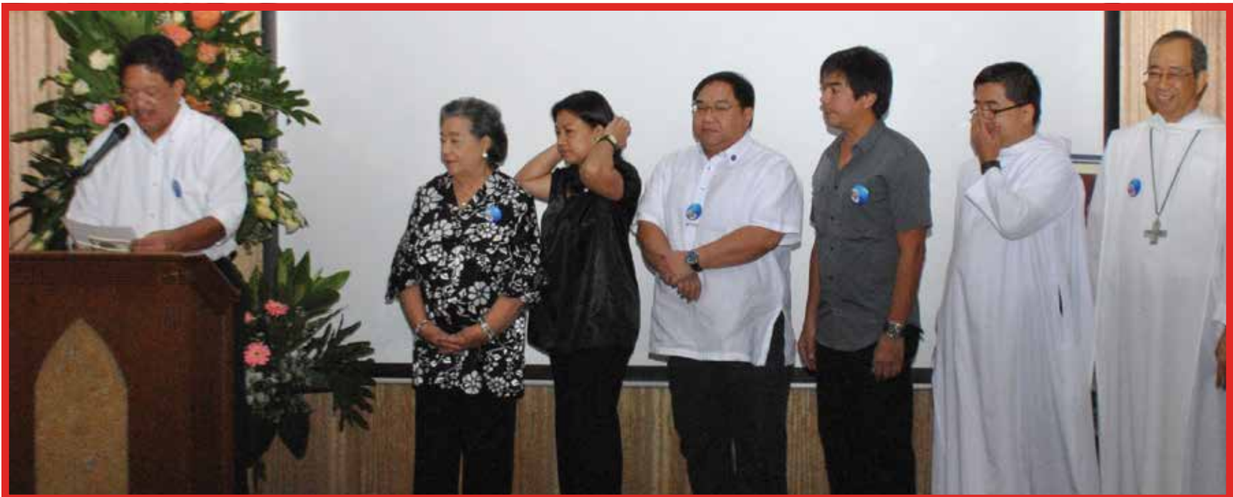
Presentation of citation to the Oca family

Distinguished Professorial Chair on Labor Relations