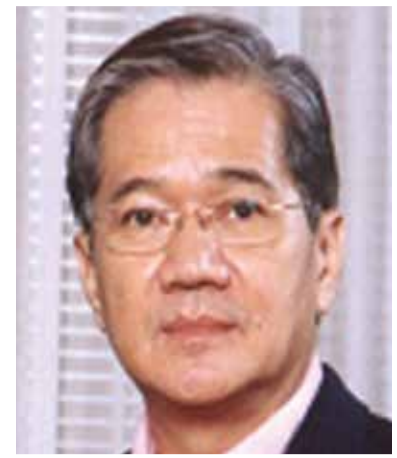
Jesus P. Francisco Distinguished Professorial Chair in Energy Efficiency and Environment Management