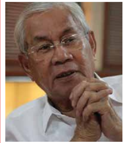
Capt. Gregorio S. Oca Distinguished Professorial Chair in Labor Relations