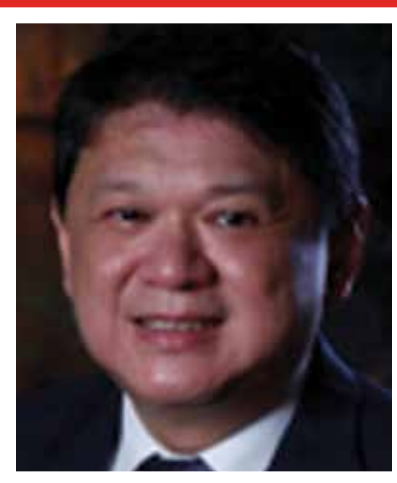
Enrico U. Dee Distinguished Professorial Chair in Entrepreneurship