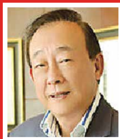
George T. Yang Distinguished Professorial Chair in Business Management