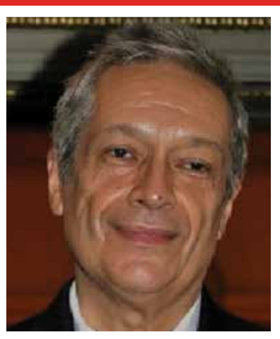
Jorge Z. Ortoll Distinguished Professorial Chair in Information Technology