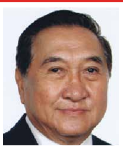
Dr. Benigno N. Ricafort Distinguished Professorial Research Chair in Finance