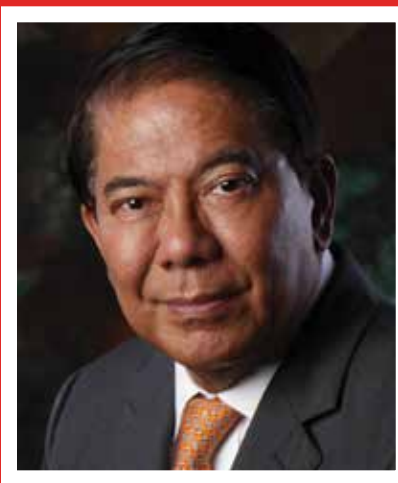
Amb. Jose E.b. Antonio Distinguished Professorial Chair in Entrepreneurship