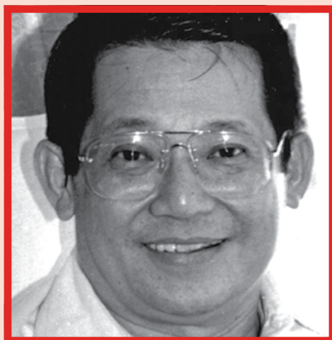
Benigno “Ninoy” Aquino