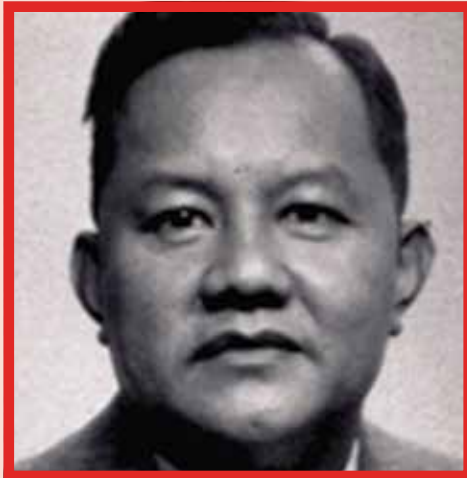
Eduardo Cojuangco, Sr.