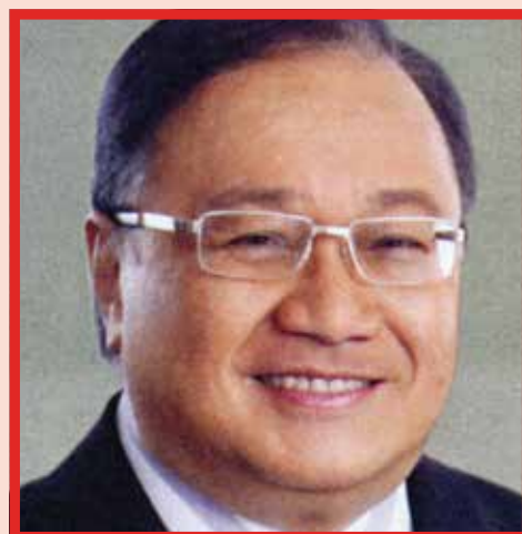
Manuel V. Pangilinan