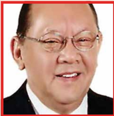
Eduardo Cojuangco, Jr.