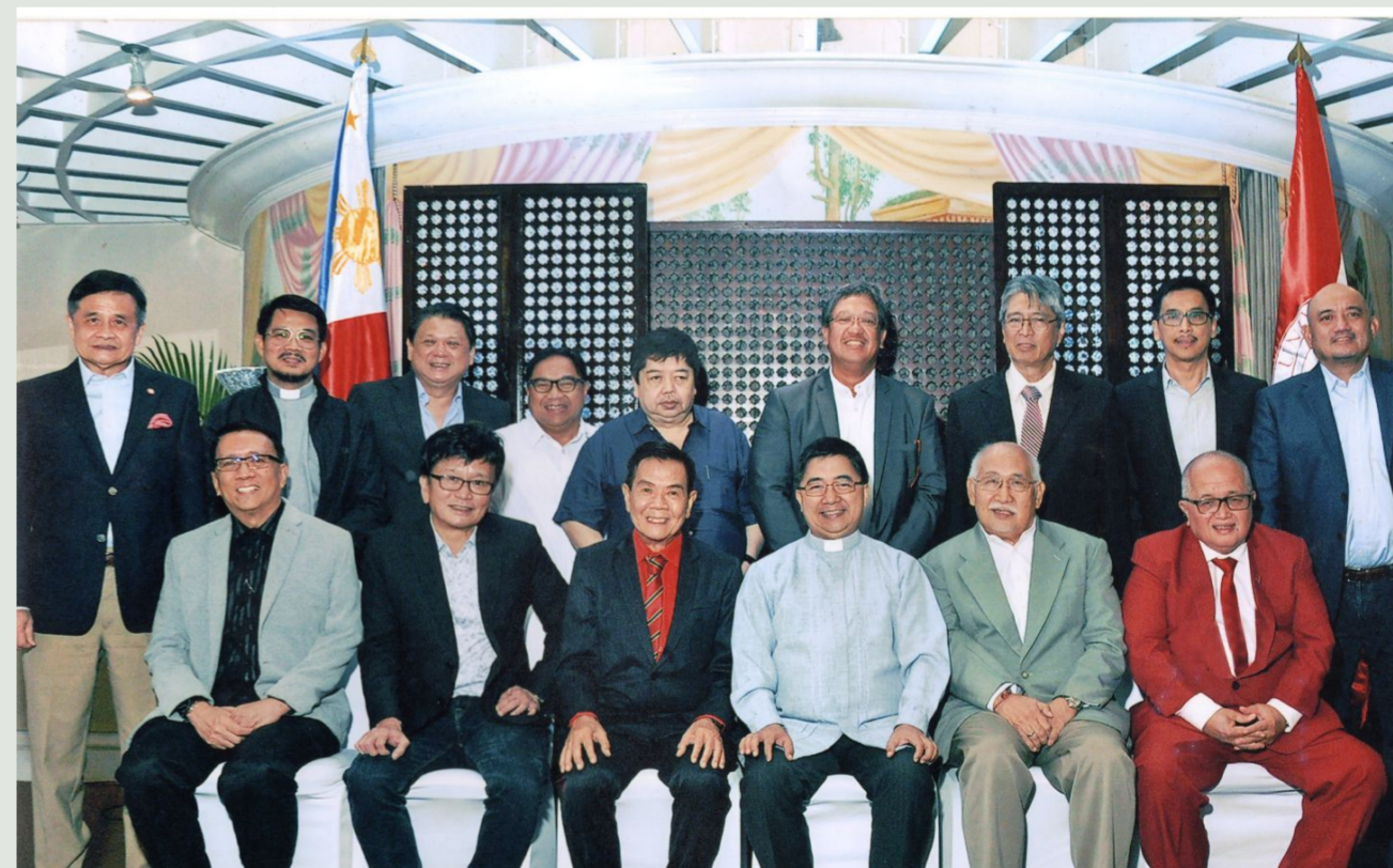
Board of Trustees 2020-2025.