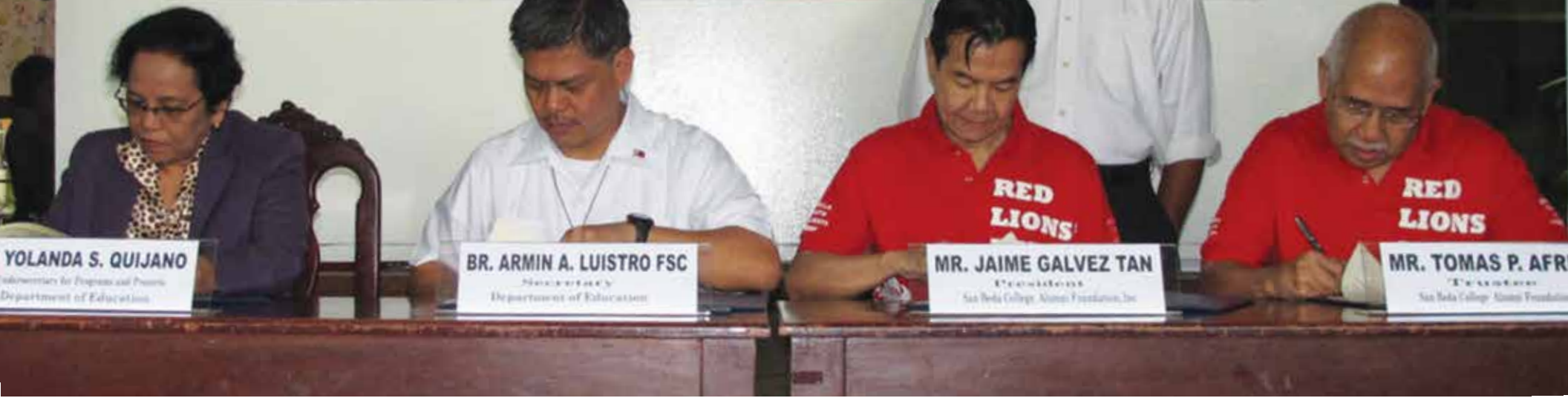
YOLANDA S. QUIJANO Undersecretary for Programs and Projects Department of Education

Let's plant native trees! : A pinoy tree for every school