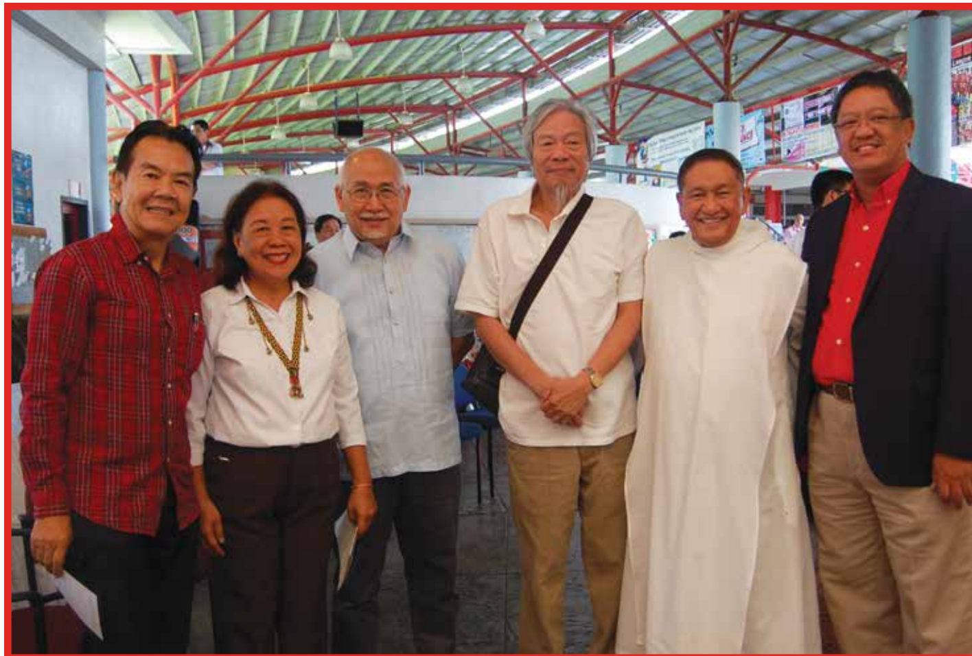
Tree planting ceremony inside San Beda Rizal campus with the SBCAF Board of Trustees, school administrators Gotianun family, and Grasfaco officers